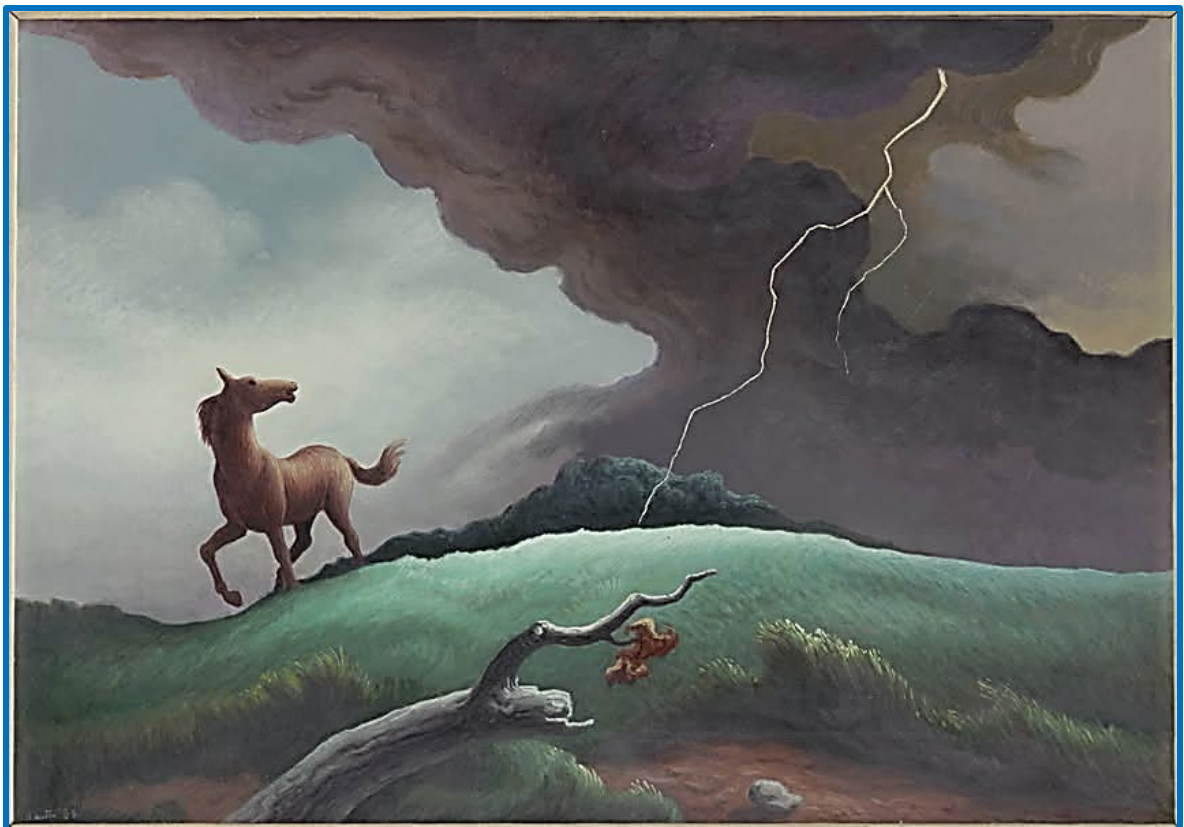
Thomas Hart Benton Spring Storm (1958)